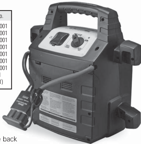
2020 BOOSTER PACK