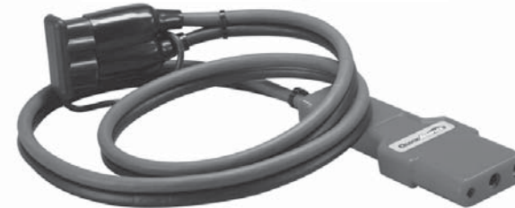
CESSNA® STYLE POLARIZED POWER PLUG-INS